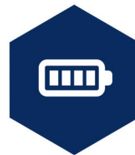
Enhances Battery Life